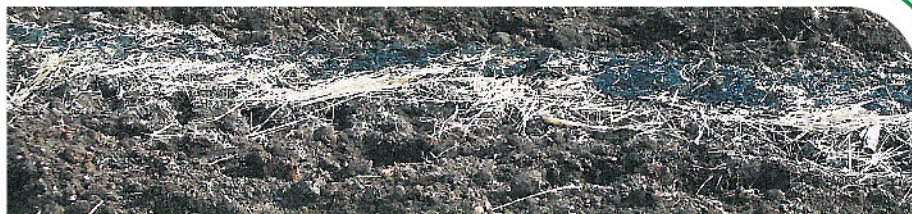
Cleaning and add on organic fertilizer